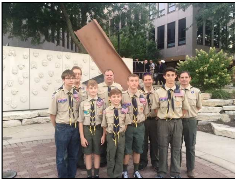
Troop 106, sponsored by Post 43, took part in the 9/11 Memorial Ceremony held at the CMDR Dan Shanower Memorial.

American Legion Post #43 PO Box 4, Naperville, IL 60566