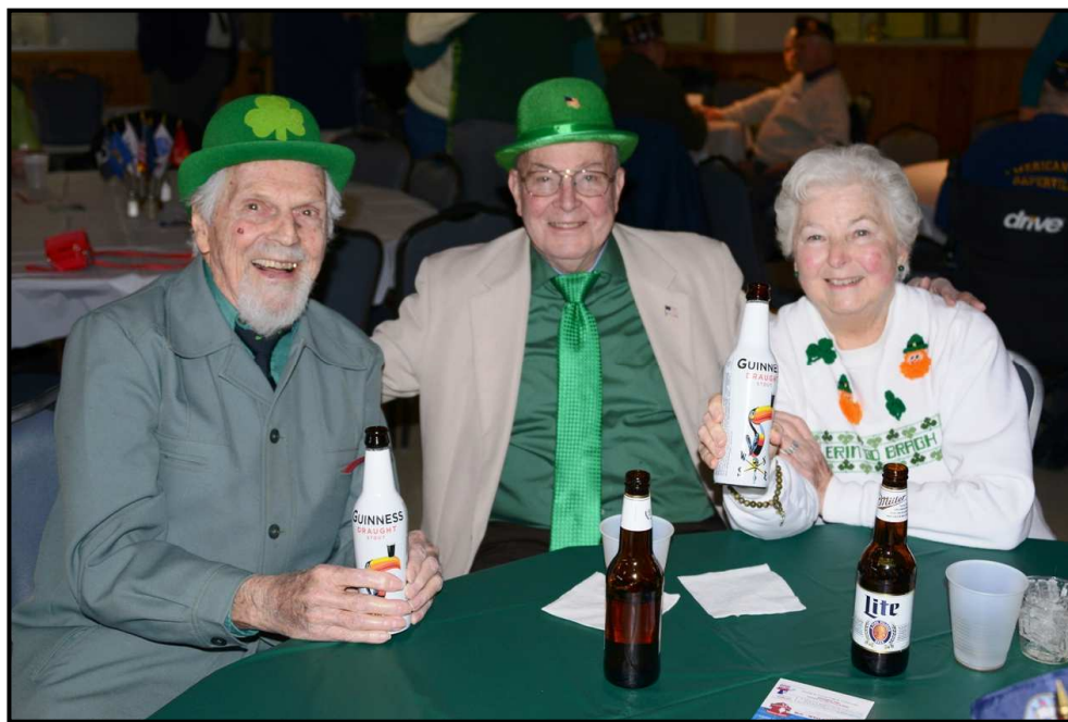
Post 43 celebrates St. Patrick's Day at March 16th Dinner/Social.

American Legion Post #43 PO Box 4, Naperville, IL 60566