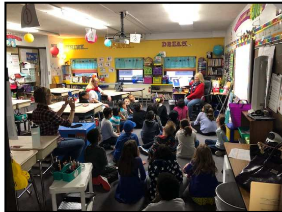
Veterans read to Georgetown Elementary School students as part of "Dear Georgetown" event held on February 22nd.