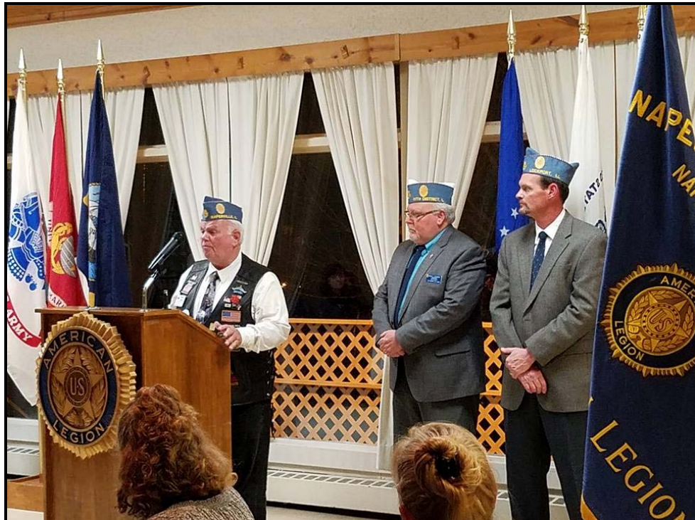
Post 43 Sons of the American Legion at January Social

American Legion Post #43 PO Box 4, Naperville, IL 60566