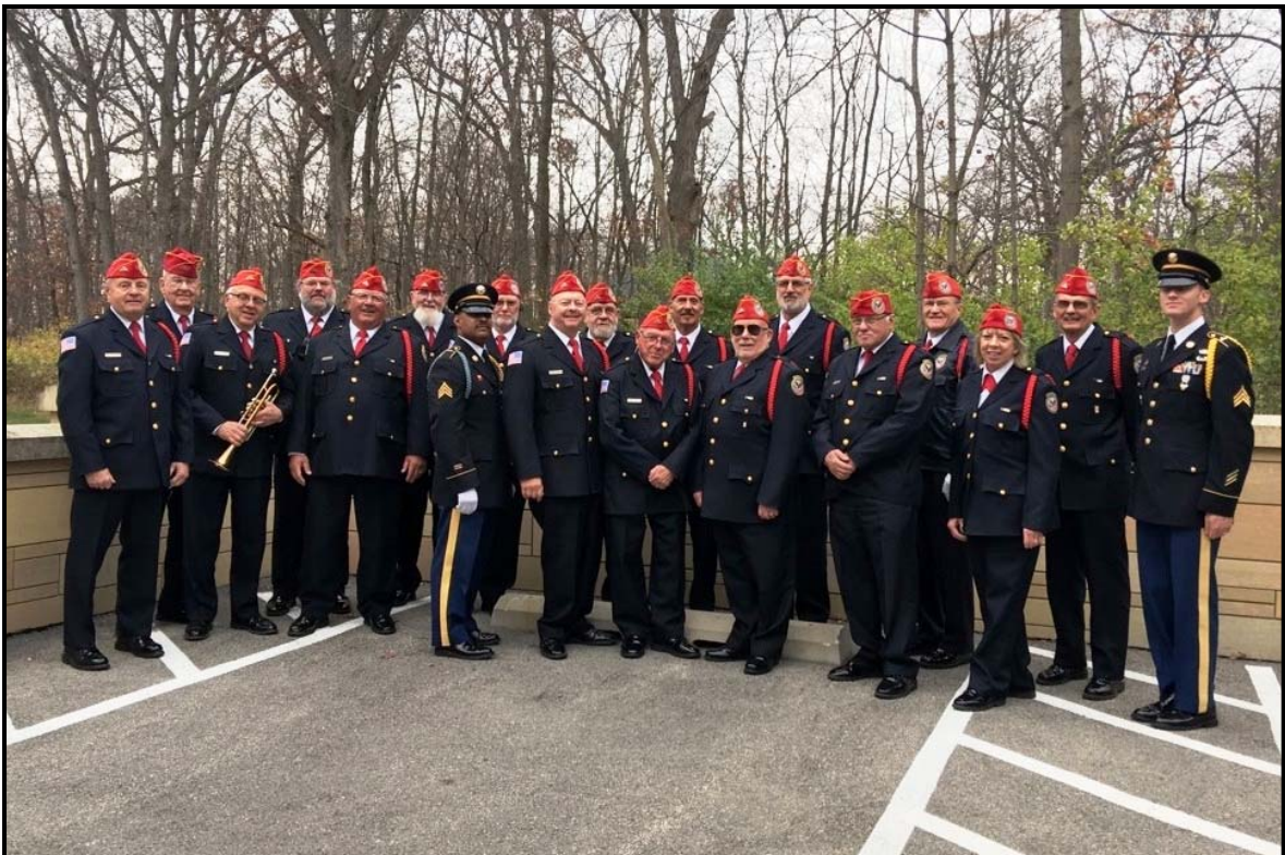
"F-Troop" Friday Memorial Squad at Abraham Lincoln National Cemetery

American Legion Post #43 PO Box 4, Naperville, IL 60566