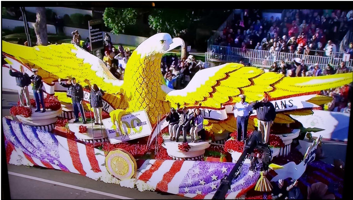
The American Legion 100th Anniversary float in the Rose Parade on January 1st, 2019 from Pasadena, California.

American Legion Post #43 PO Box 4, Naperville, IL 60566