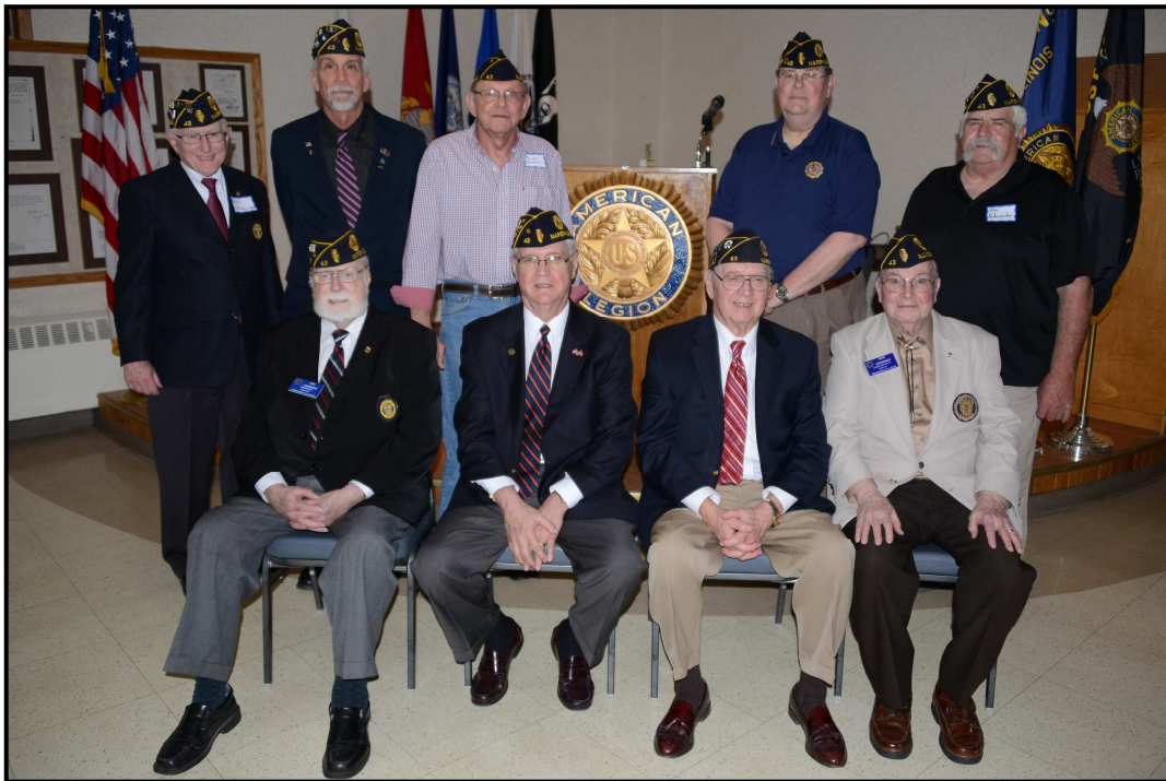
Post 43 Past Commanders at the April Legion Social

American Legion Post #43 PO Box 4, Naperville, IL 60566